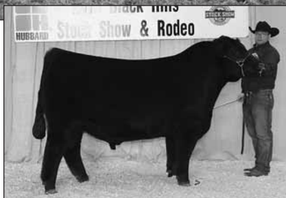
SCAR Mr Deeds A579, sire of Lots 12 - 14.