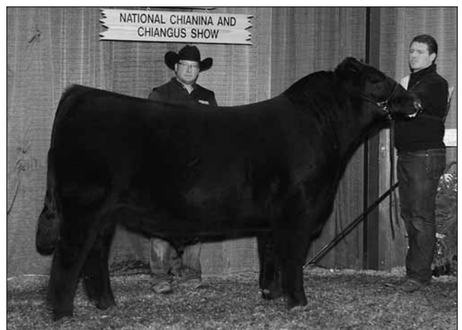
MEFC Northern Advangate, sire of Lot 61 embryos.