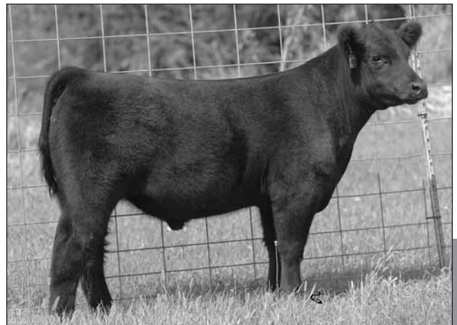
Fu Man Chu steer from our 2015 Club Calf Sale.