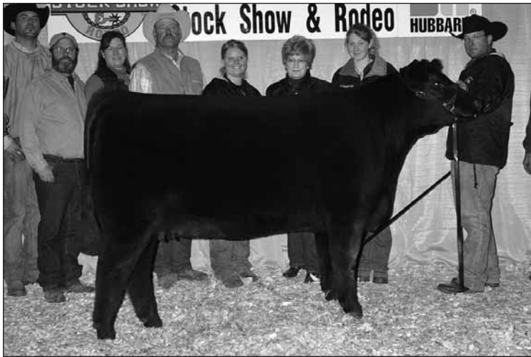
2009 BHSS Supreme Champion Female, daughter of Lot 57.

57 03.24.05 Tattoo: TTBR 590R ACA# 318730 C 38.57% Chi TTBR Ms Tommy 590R