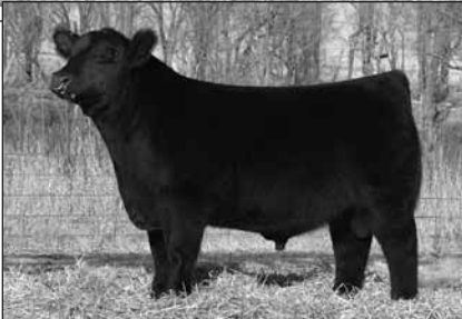
JHC Mr Double Down 511B, a maternal brother to Lot 1. Double Down sold in our 2015 Hybrid for Profit Sale to MMA Chiangus of Texas.