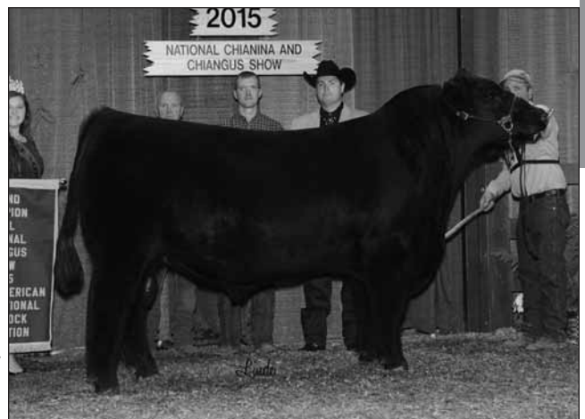
Exclusive Use, sire of Lot 60 embryos.